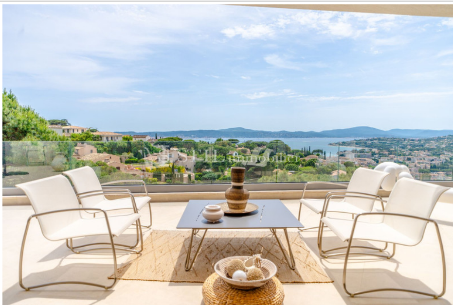
Villa Ref. : V1119M Sainte-Maxime

Villa for sale in Sainte-Maxime. In the sought-after Sémaphore area, close to the town center, this superb villa has been completely renovated with high-quality materials. Magnificent sea views over the Gulf of Saint-Tropez offer: a reception hall, cloakroom, and guest toilet, a large, bright living room with a fireplace opening onto a large terrace, a fitted kitchen with a pantry, and five bedrooms with bathrooms, including a master suite with a dressing room and solarium. A laundry room, games room, and garage are also available. A large heated infinity pool and fully equipped pool house complement the garden, beautifully planted with Mediterranean plants. Drilling is available.